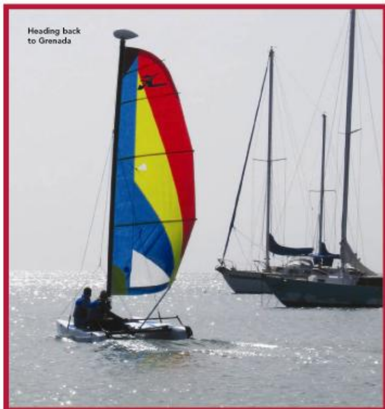
Heading back to Grenada